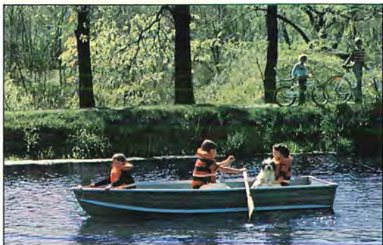
Starcraft's Sea Lite 12. An economical and extra-light open fishing boat. Weighs only 98 lbs.

At Starcraft we build fishing boats with handling and stability that help you land the big ones. Boats with the lasting quality that only comes from the best materials. They're easy-to-