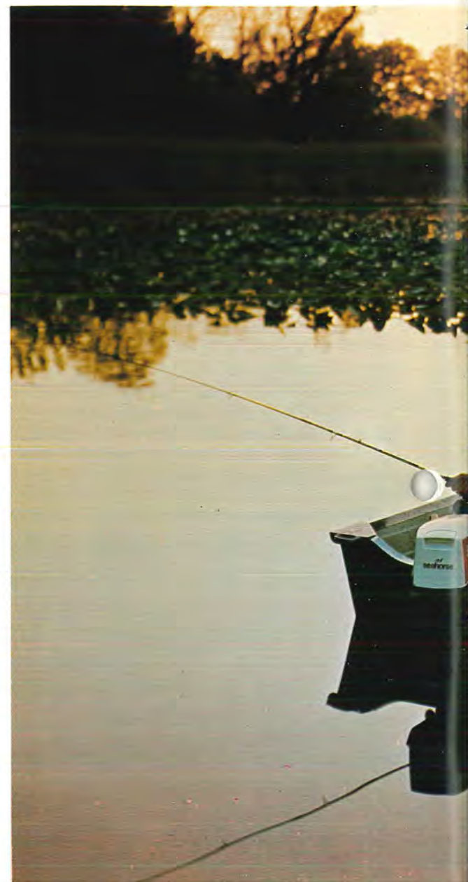
(Right) Starcraft's Seafarer 16 is a strong well-made boat that gives you plenty of room to land that big fish.

We also make two extra-light car toppers: the Sea Lite 14, which weighs 120 lbs., and one convenient and economical Sea Lite 12 which only weighs 98 lbs.