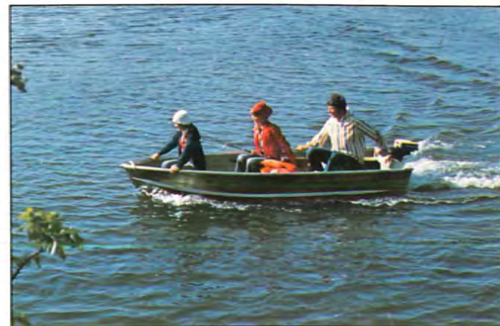
(Above) Sea Lite 12, compact and light in weight, with top performance at a low price.