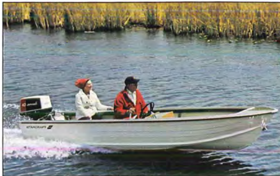
Runabout performance and ample space make the side-console Kingfisher 16 ideal for fishing.

The Mariner, in 21-, 18- and 16-foot models, is a center-console fishing machine. It gives you cockpit space to fight the big ones. A raised casting platform in the bow which doubles as a