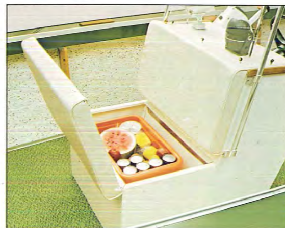
Up forward the Mariner 21 console doubles as a handy storage bin just right for a cooler.