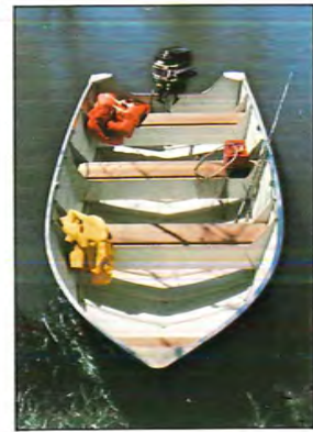
(Left) Seafarer 16 is designed to carry five adults and their fishing gear.