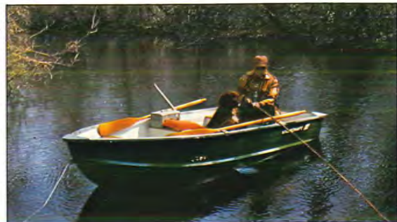
Like all models in our Seafarer line, the Seafarer 12 has varnished mahogany seats and an anti-skid interior. A perfect place to spend an early morning fishing.

Starcraft's open fishing boats have for decades led the industry. They're made with type 5052 marine aluminum, the kind that's used on costly custom yachts. And they're held together exclusively with aircraft-type rivets.