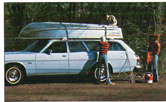
(Below) Starcraft's Sea Lite 12 is so easy to handle it can even be carried on a car top.