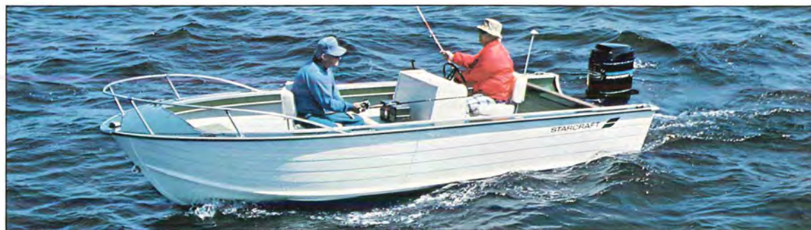
Starcraft's Mariner 18. Ideal for big-water fishing. It has a center console, a raised casting platform in the bow and more than enough space in the cockpit area to land the big ones.

And aluminum helps us build a fishing boat that costs you less. To buy, to power, to fuel and to tow. Its lighter weight means you might not