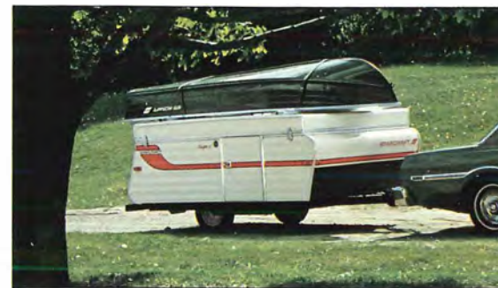
Starcraft's strong, but lightweight, aluminum construction makes our fishing boats easy to bring along.

3. Aluminum: The Ideal Way To Build A Fishing Boat. Starcraft is a major builder of fiberglass runabouts and cruisers. But all our fishing boats are built exclusively of aluminum. By choice. Because we know a fisherman's special needs demand the rugged strength and