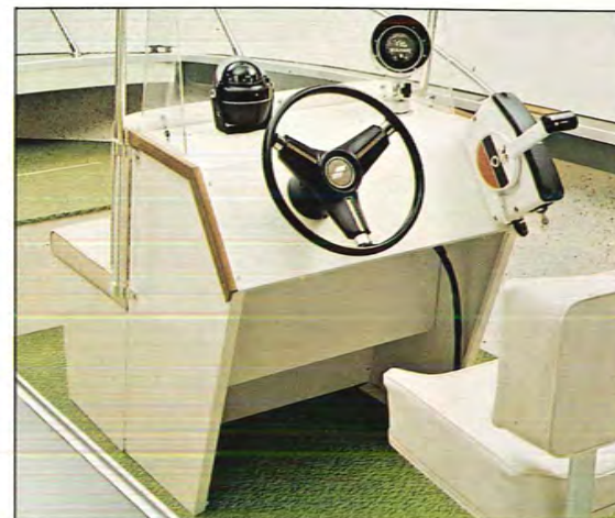
New this year on the Mariner 21 is this teak trimmed center console—with a stainless grabrail for extra safety and plenty of room on top for instruments.