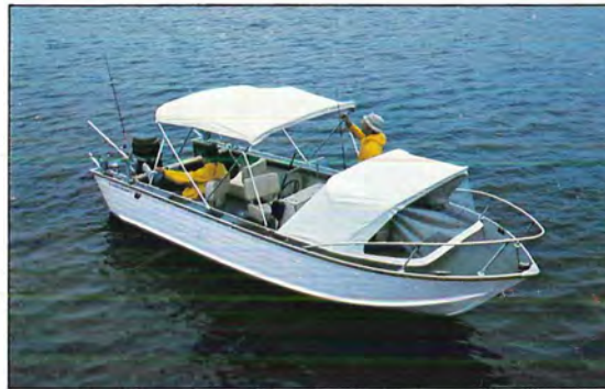
The Mariner 21's optional Bimini top gives protection against sun and rain while still providing a large open cockpit.

The swiveled fishing chairs are thickly padded and extra solidly mounted for hours of strain-free trolling. There is dry storage space