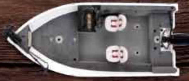
STARFIRE 1600 SC Shown with optional Trolling Motor.