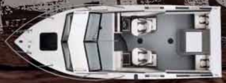
ISLANDER 221 I/O