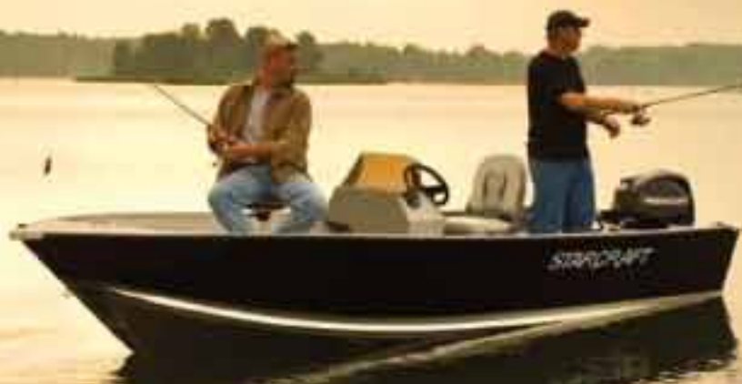
PRO CAMP 1620 SC