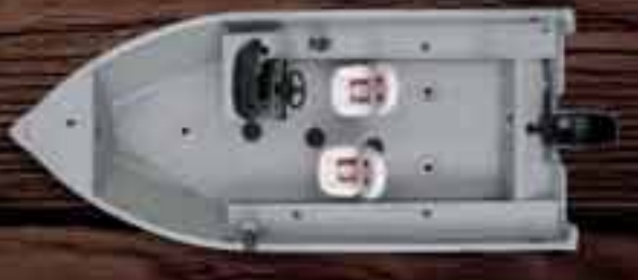
FREEDOM 160 SC