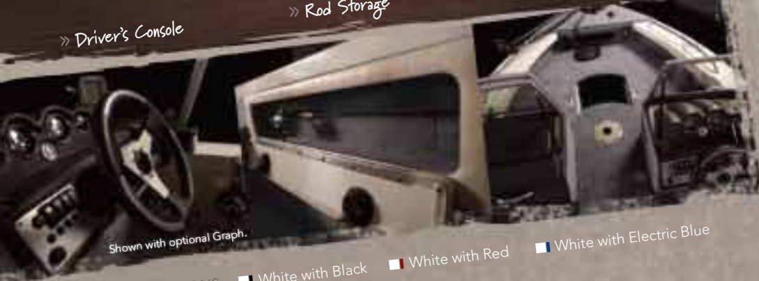
Shown with optional Graph.

COLOR OPTIONS: ■ White with Black ■ White with Red ■ White with Electric Blue