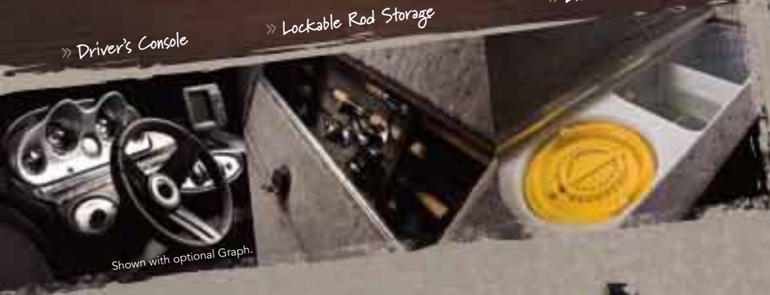
Shown with optional Graph.