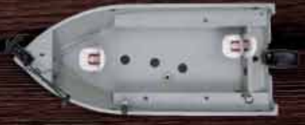
FREEDOM 160 T Shown with optional Trolling Motor.