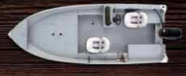
PRO CAMP 1620 SC