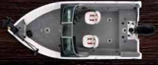
STARFIRE 1600 DC Shown with optional Trolling Motor.