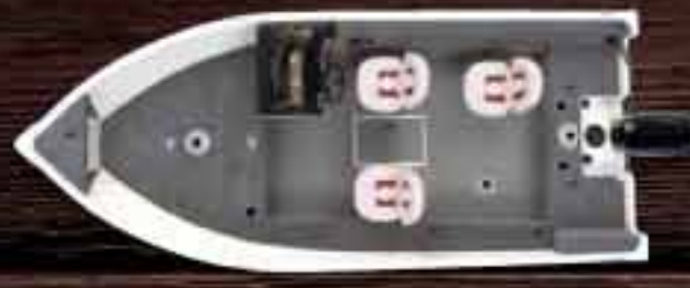
STARFIRE 1700 SC