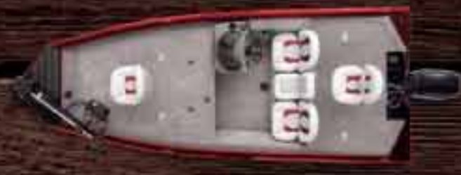
STARCASTER 179 PRO V