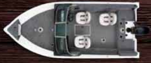
STARFIRE 1700 DC