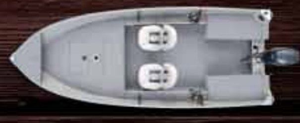
PRO CAMP 1620 T