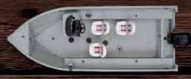
FREEDOM 180 SC