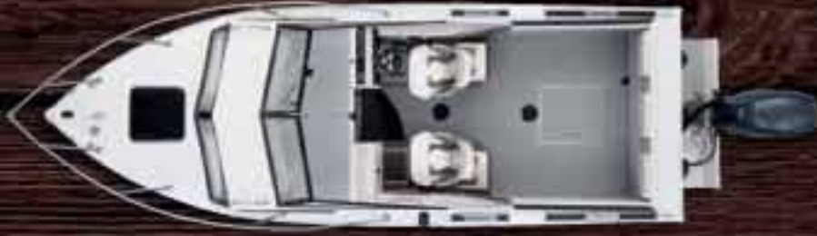
ISLANDER 221 OB