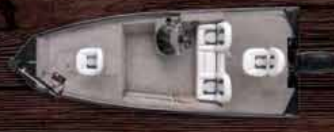
STARCASTER 178 SC