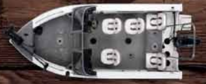
SUPER FISHERMAN 170 Sport Shown with optional Trolling Motor, Ski Tow and Swim Platform.