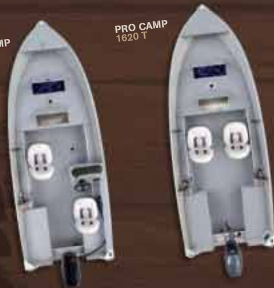
PRO CAMP 1620 T