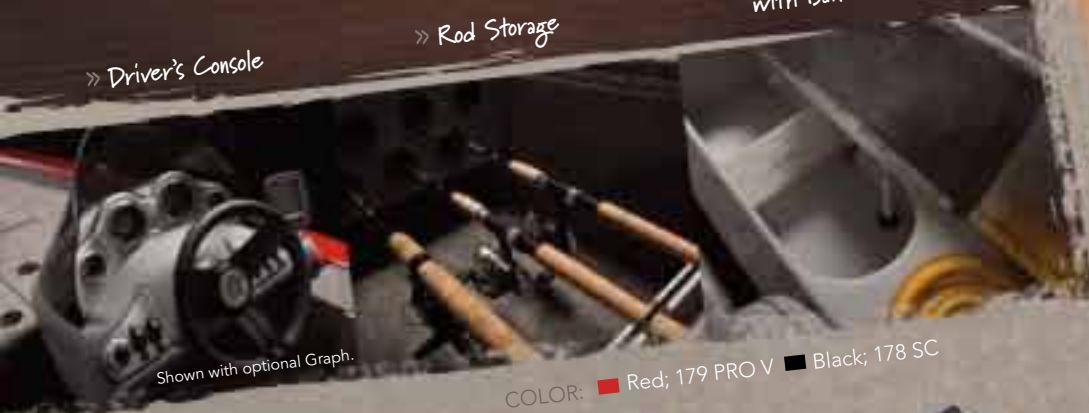
Shown with optional Graph.