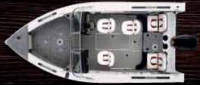
SUPER FISHERMAN 180