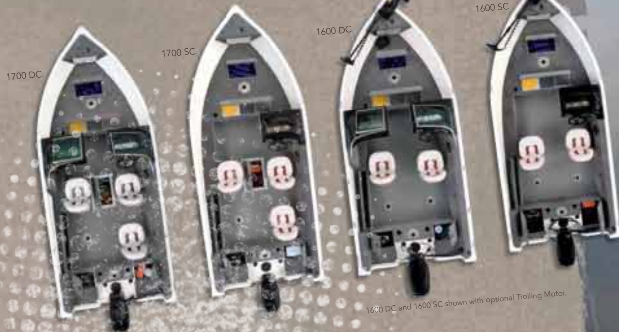
1600 DC and 1600 SC shown with optional Trolling Motor.