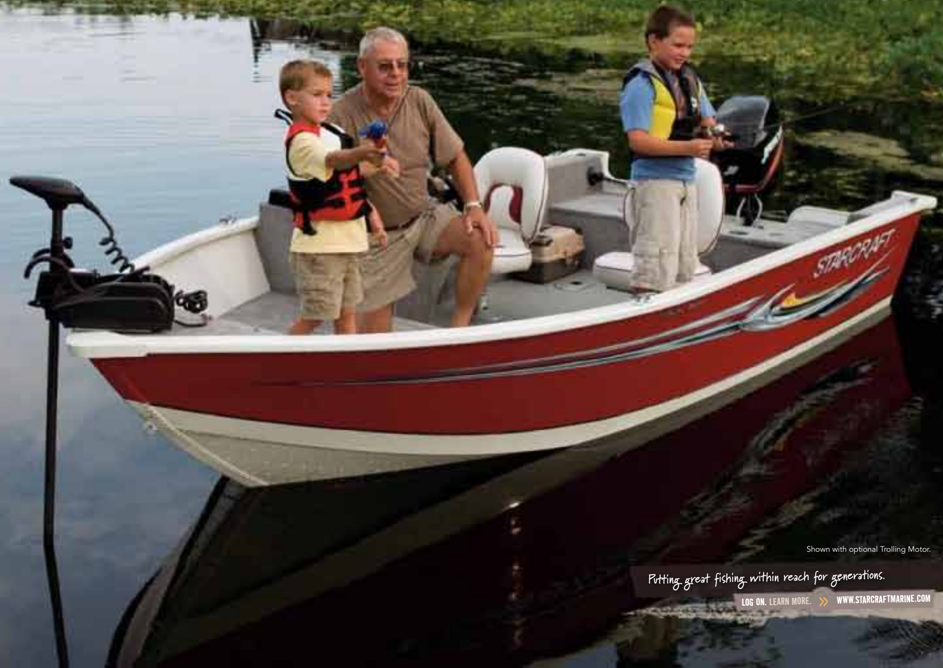
Shown with optional Trolling Motor.

Putting great fishing within reach for generations.