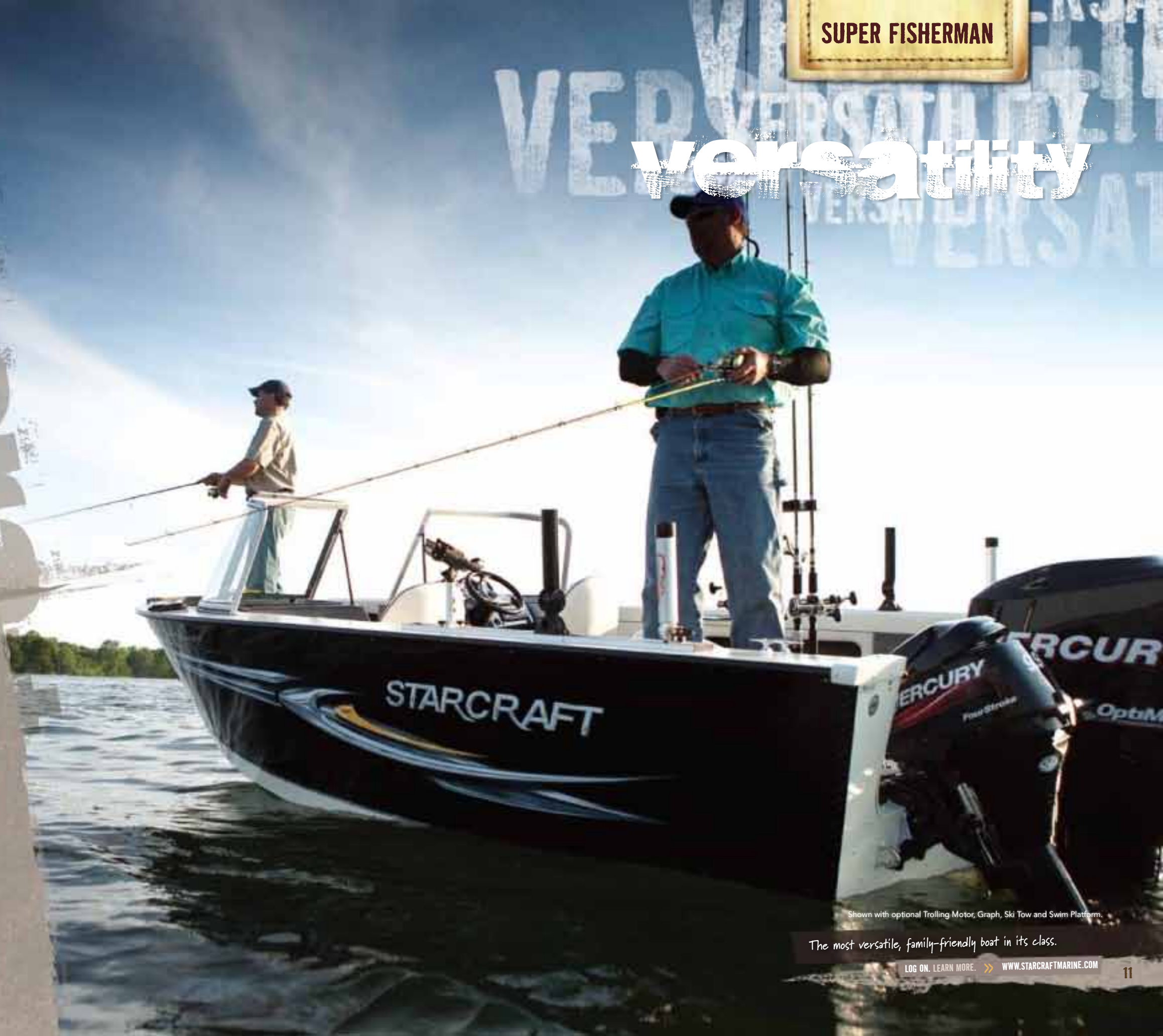
Shown with optional Trolling Motor, Graph, Ski Tow and Swim Platform.

The most versatile, family-friendly boat in its class.