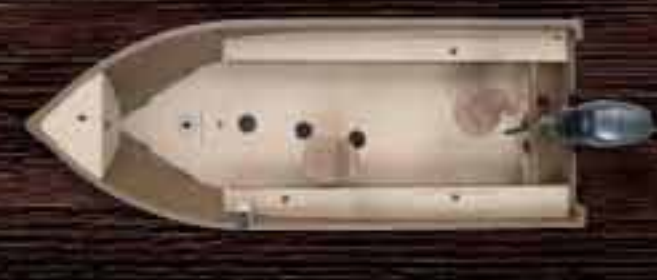
FREEDOM 180 T