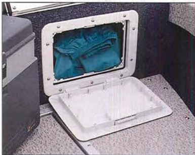
Bow storage keeps your gear safe, dry and ready to use when needed.